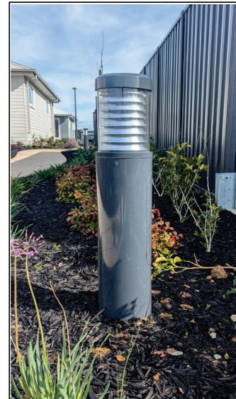
Standard Titan Bollard