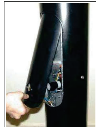
Secure access to lamp

VICPOLE STREETSCAPE SOLUTIONS www.vicpole.com.au