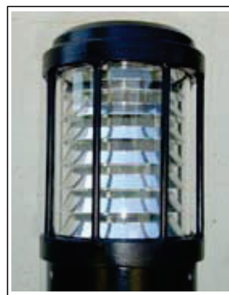
Optional Protective Guard