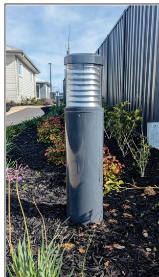
Standard Titan Bollard