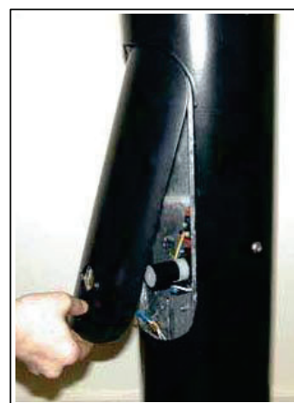
Secure access to lamp

VICPOLE STREETSCAPE SOLUTIONS www.vicpole.com.au