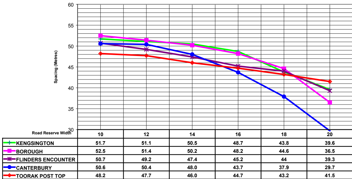
Post Top Luminaires Spacing Graph (80W MV) for LIGHTING CATEGORY P4 Mounting Height - 5.0 metres

Post top light fittings for use in roadways and housing estates offer an alternative look to the traditional top and side entry light fittings. Available with or without PE switching and can be matched with a variety of Vicpole columns with stylish effect. Offering light fittings from numerous manufacturers, Vicpole is in the unique position to be able to customise your project without compromise.