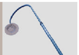
Vicpole Architectural Streetscape Solutions