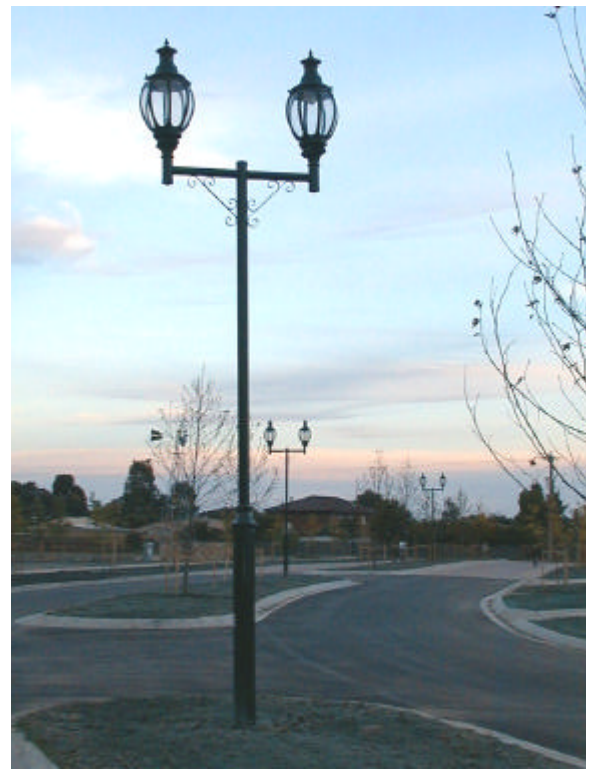
VESI APPROVED POST TOP CATEGORY P LIGHT FITTINGS