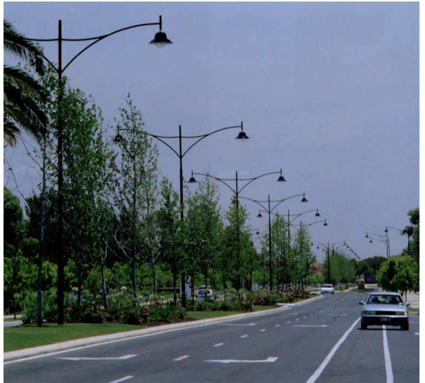
VESI APPROVED CATEGORY V LIGHT FITTINGS