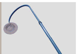
Vicpole Architectural Streetscape Solutions